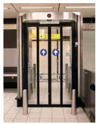
FlipFlow WIDE, AMS