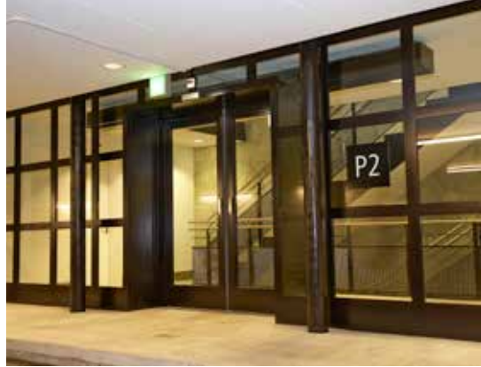
Automatic fire-protection door, multi-storey car park