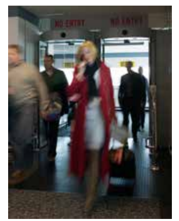
FlipFlow SINGLE, GLA