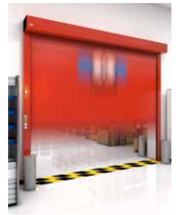
Rapid shutter gates SPEEDCORD