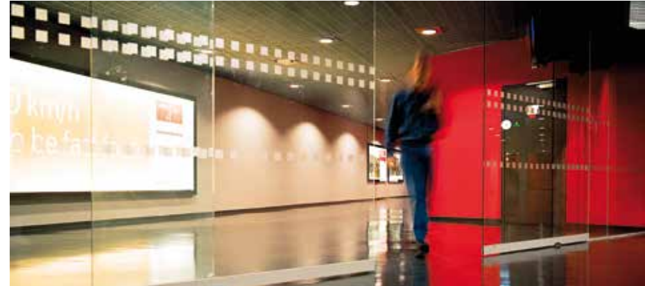
Frameless automatic sliding door, BSL/MLH