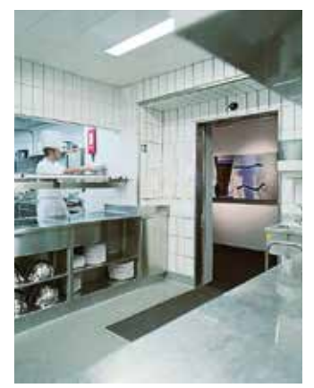
Sliding door, kitchen/pantry, LYS