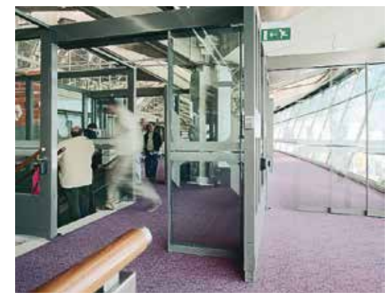
Sliding door, restaurant, LYS