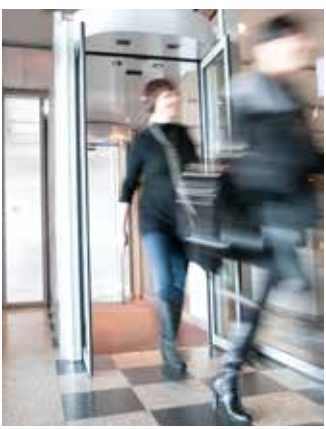
FlipFlow TWIN, BLL