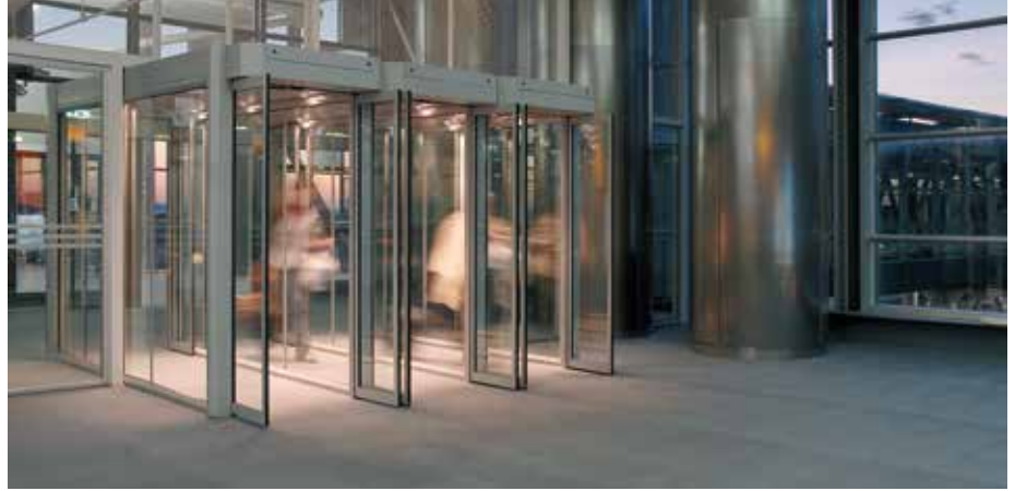
FlipFlow TWIN, MRS