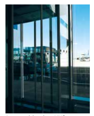
Automatic sliding door, MUC

Our products are ISO 9001:2008 certified and also comply with all relevant international norms and standards.