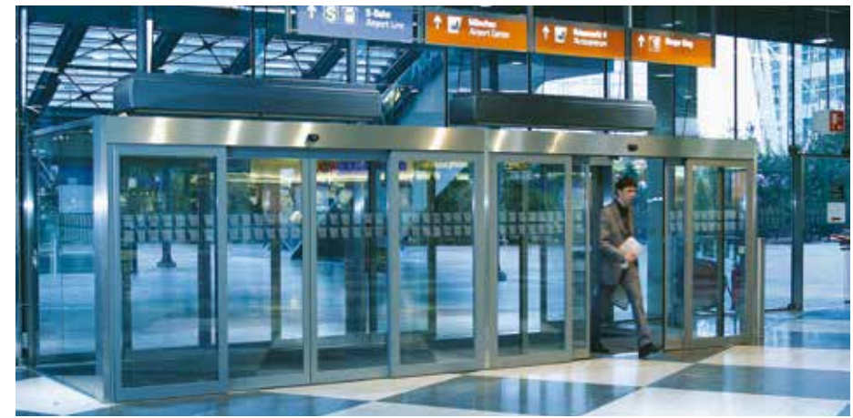
Smoke-protection doors, entrance area, MUC