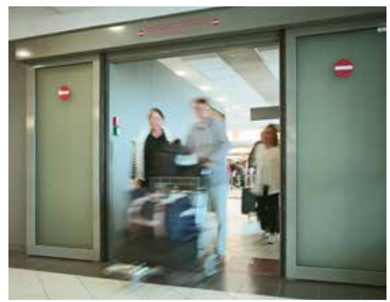
Automatic fire protection door, baggage claim, LYS

Rapid acting shutter doors from record guarantee a smooth flow of traffic and also function as an excellent thermal barrier. Shutters comply with all customs' regulations relevant to the luggage or freight area.