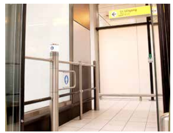
FlipFlow WIDE, customs exit, AMS