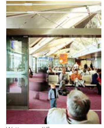
Waiting room, LYS