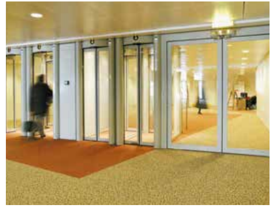
FlipFlow TWIN with escape route doors at the sides, BOD